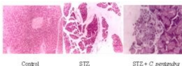
Figure 2 The effect of ethanolic bark extract of C. pentandra on STZ-induced pancreatic damage in rats

The pancreas of diabetic group (Figure 2) showed reduction in size, scarcity of cells along with degeneration and necrosis, large decrease in endocrine tissue. Partly decrease of degenerative cells and the protective effect of tissues were noticed in the C. pentandra extract treated groups.